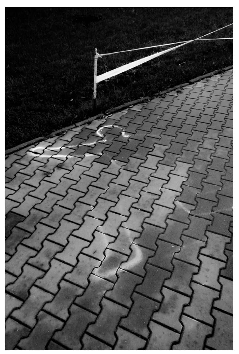
■ Post "Do you think outside the box?"