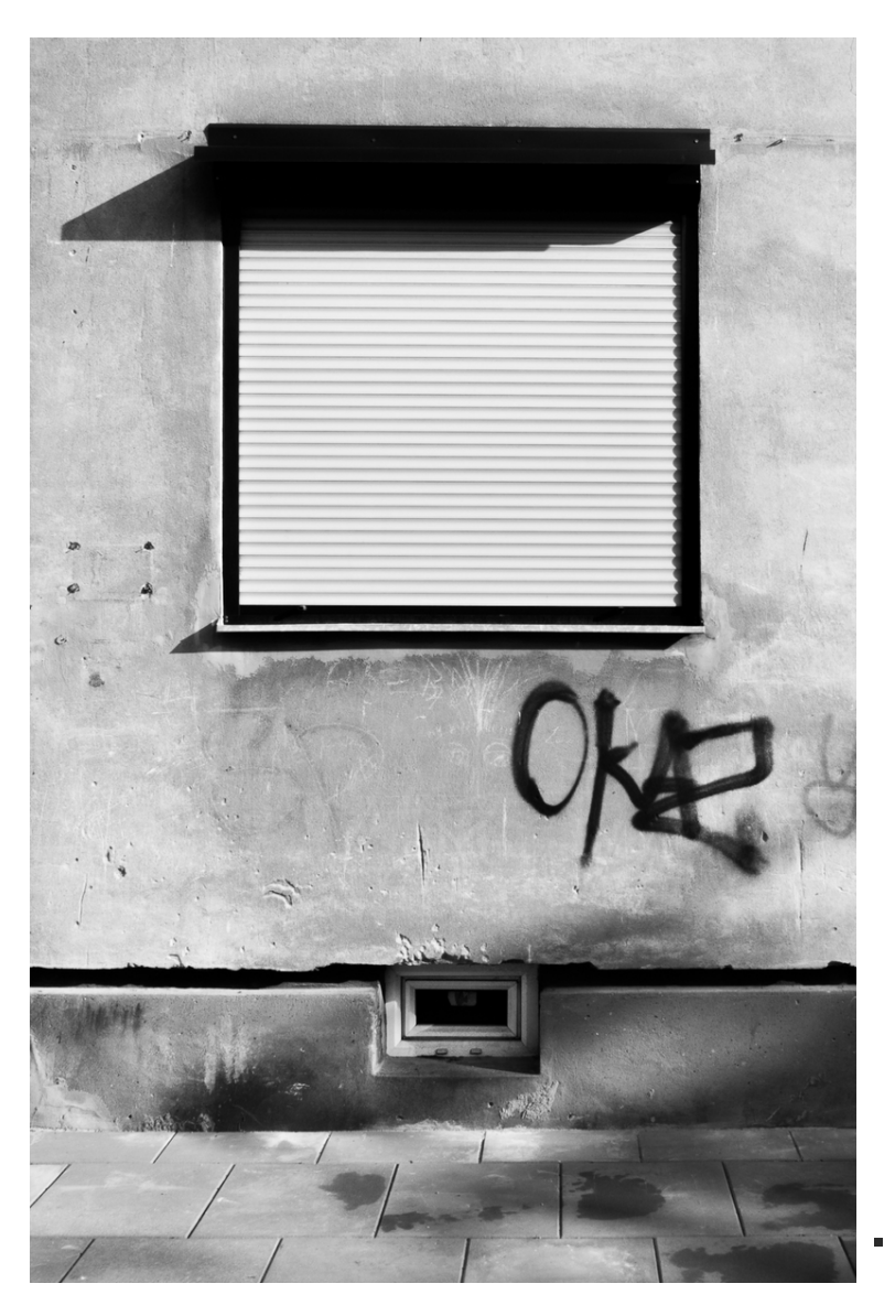
Post "Big Brother" (see also p. 8 ond 10)