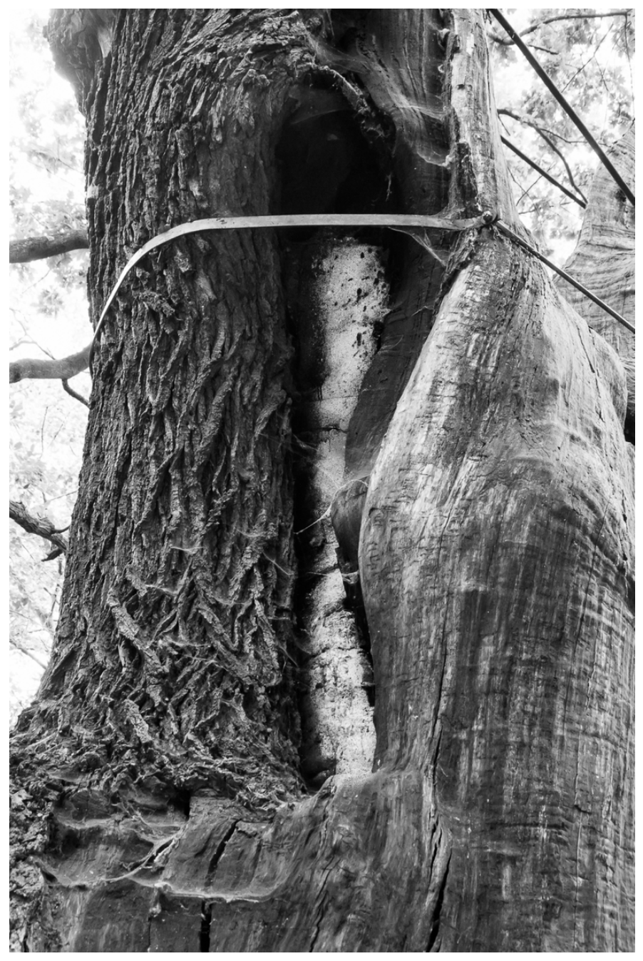
■ Post "Do you think outside the box?"

When I stop to think and start to do some things connected with relaxation, ideas keep coming to my mind. Relaxation can bring me a lot of inspirations. New ideas sometimes are just flowing to my mind, often somehow unconsciously. This practice works for me very well. If you still want to think outside the box, I encourage you, my Dear Friend, to stop thinking. Relax and empty your mind. The best solutions for complicated issues will come sooner than you expect. Speaking shortly: remember that resting is as important as hard work. Proper, regular relaxation will provide you many benefits, including new, fresh approaches to many issues.