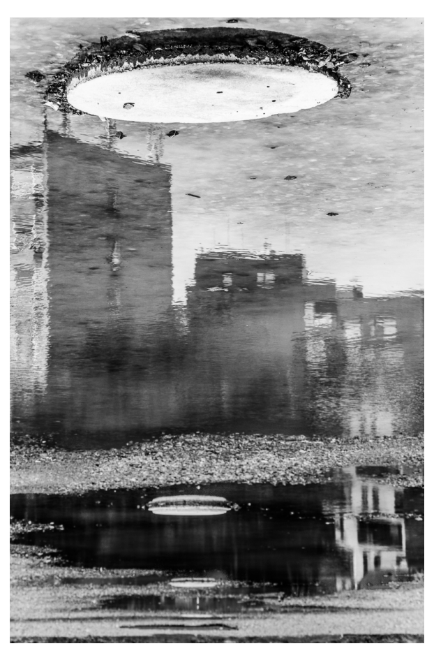
■ Post "Can you hear me, Major Tom?" (Front cover: "Big Brother")