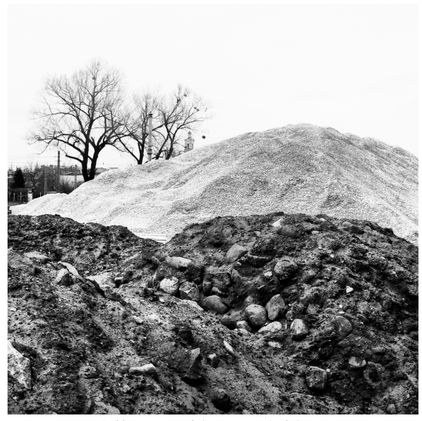
Post "How to find beauty in our daily routine?" (also below)

In a subsequent post ("How to find beauty in our daily routine?"), I mentioned that I am convinced that every day, in every place of our planet, everyone can spot a lot of fascinating worth eternalize sights photographs. The issue is that the vast majority of us do not see those magical sights. People are often too busy to focus on visual analyzing their surroundings. Moreover, those who notice odd views nearby them sometimes do not have the camera to make a picture. Finally, those who have cameras not always can catch this moment as good as they would wish like to.