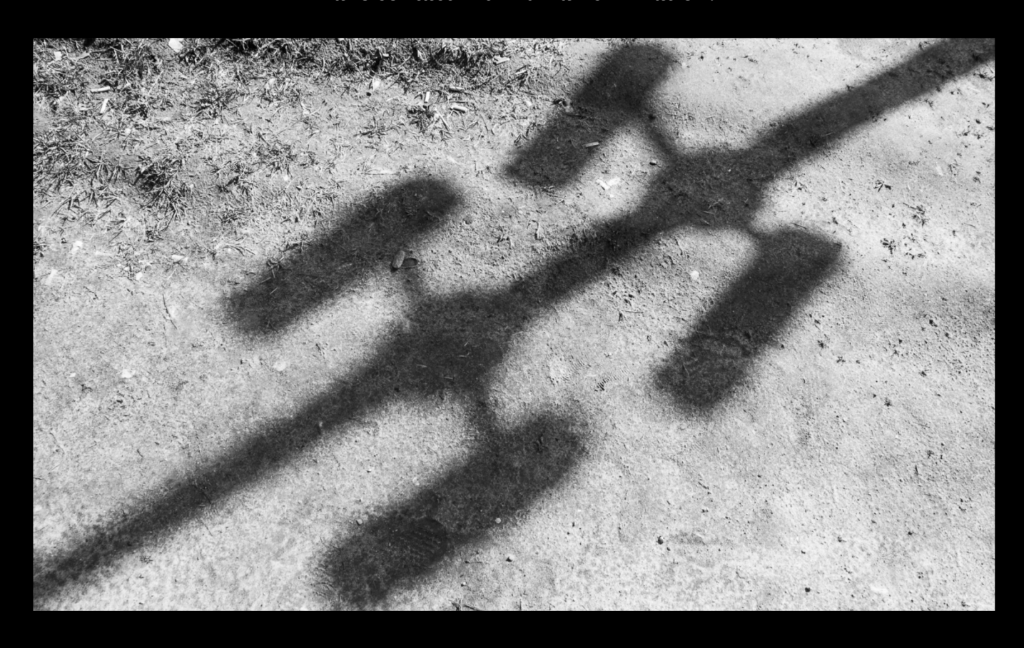
• Post "Earth Wars" (from p. 17 to p. 23)

Boxoids suddenly landed. Nobody expected them. They left their spaceship to make contact with human civilization.