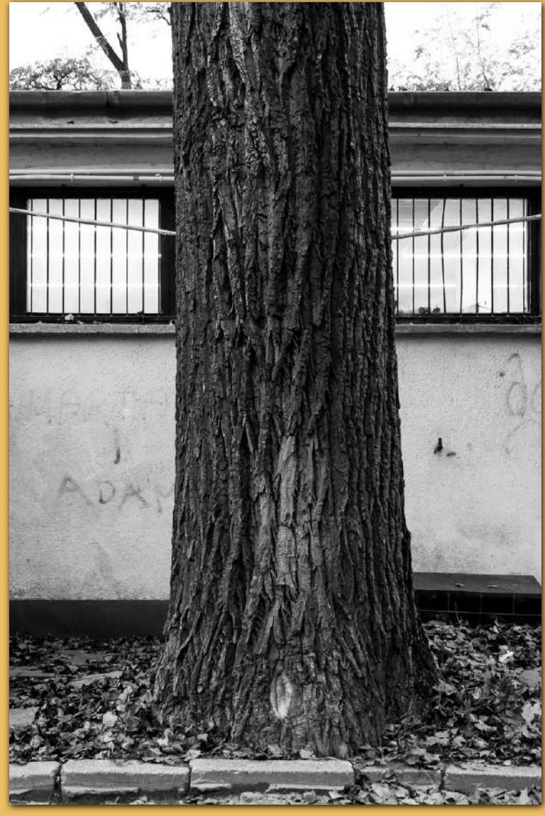
Post "It's my way"

That's why I'm trying to be like water. What does this mean in practice? I try not to feel pain despite the blows inflicted on me. I wrote more about it in "Diaries" from December 2017. There will always be something that can mentally destroy and break us.Nevertheless, it is worth remembering in times of crisis that, in the end, we will all die anyway. Every journey, whatever route it takes, must end someday. Remembering death, paradoxically, we can get incredible strength to act. Creating art is the key to success for me. I encourage You, my Dear Friend, to try to find my own path and follow it. Remember, however, that you won't find the answer to critical questions along your way. Doubts will only multiply. Nevertheless, you'll still be closer to your inner peace.