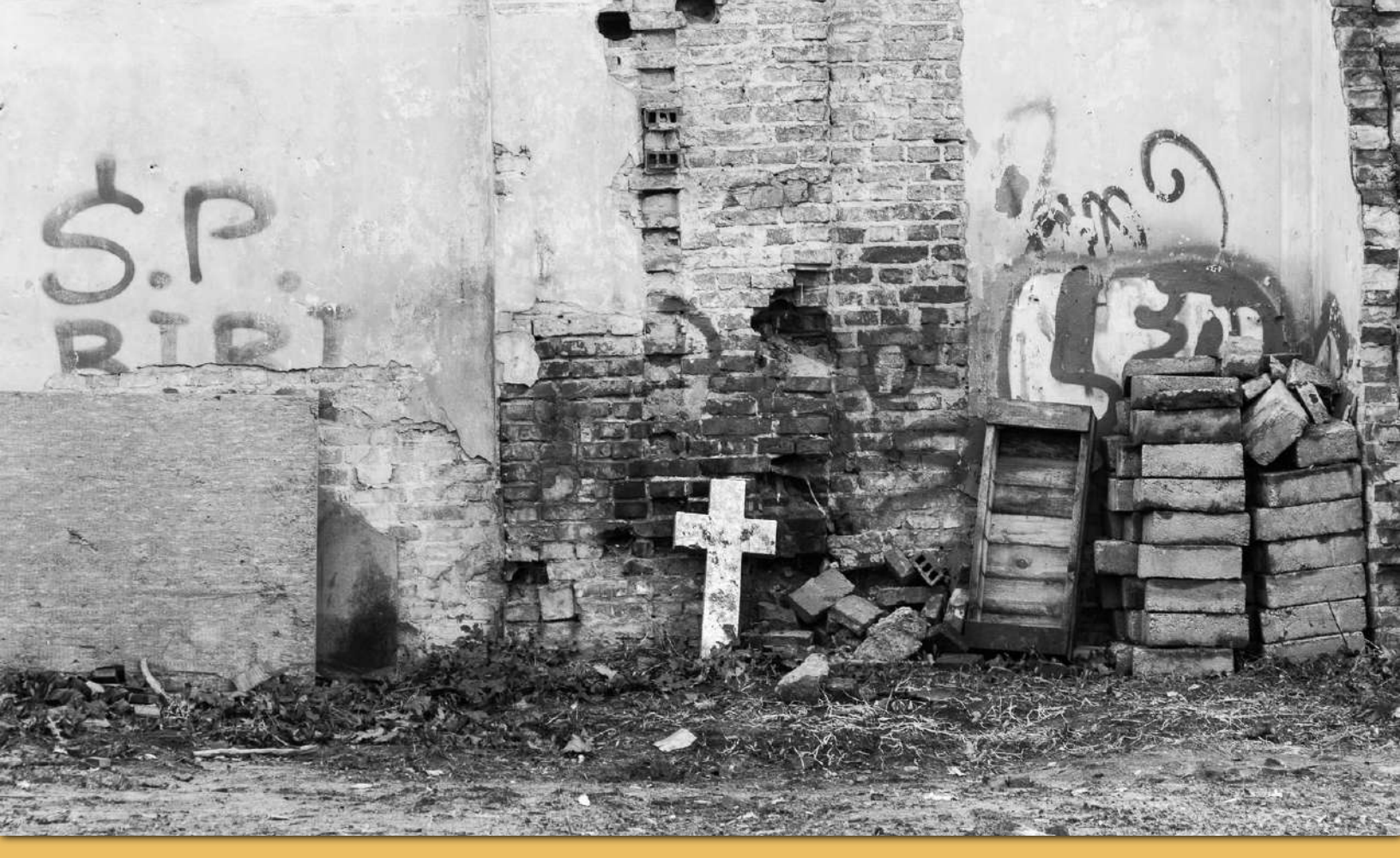
• Post " "I'm not in love with my car."