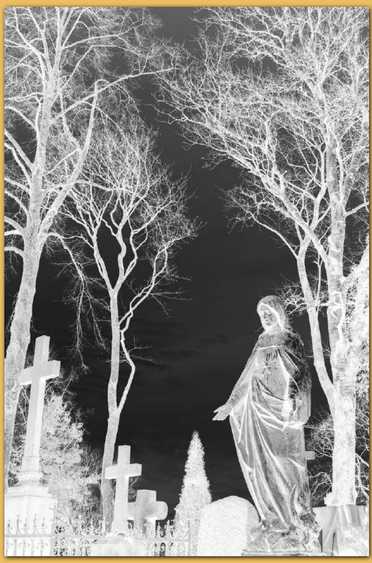
Post "The Centengrian"