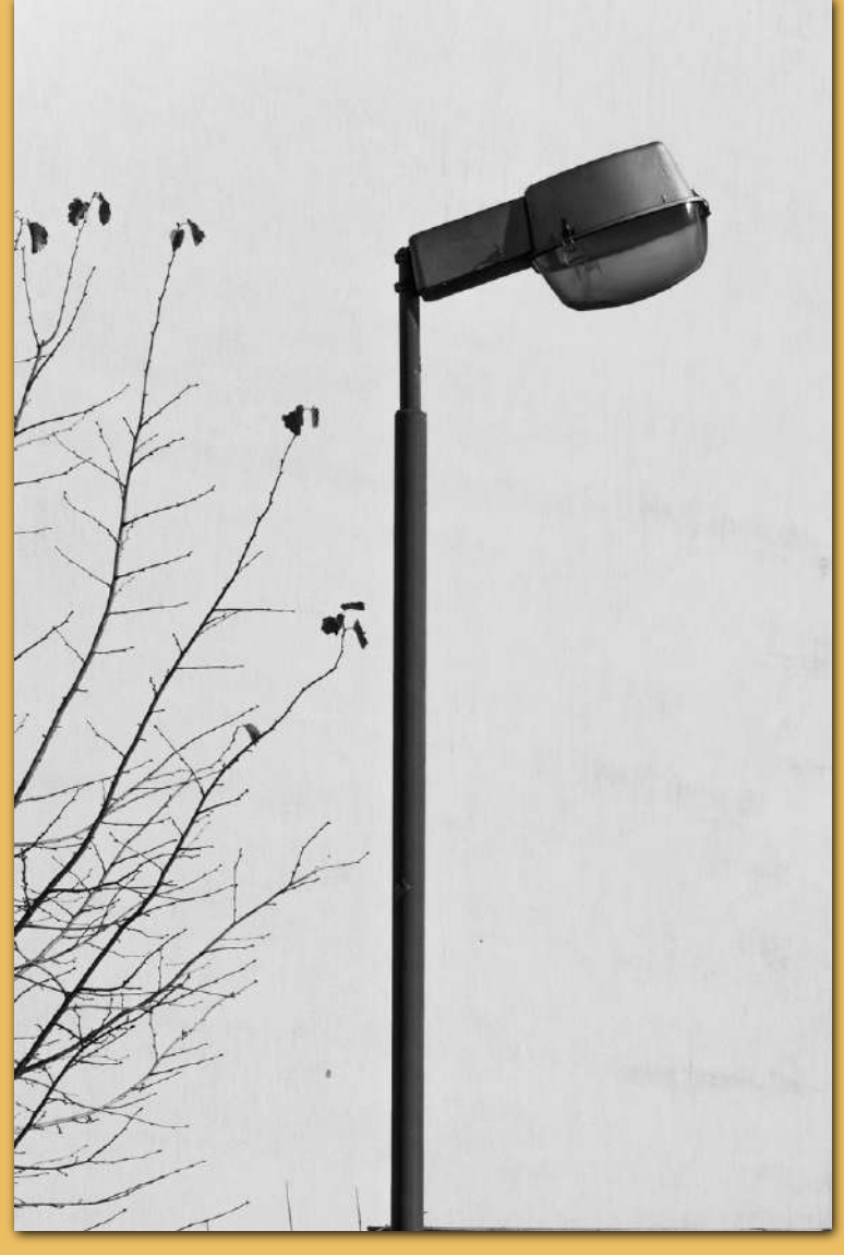
• Post "It's my way"