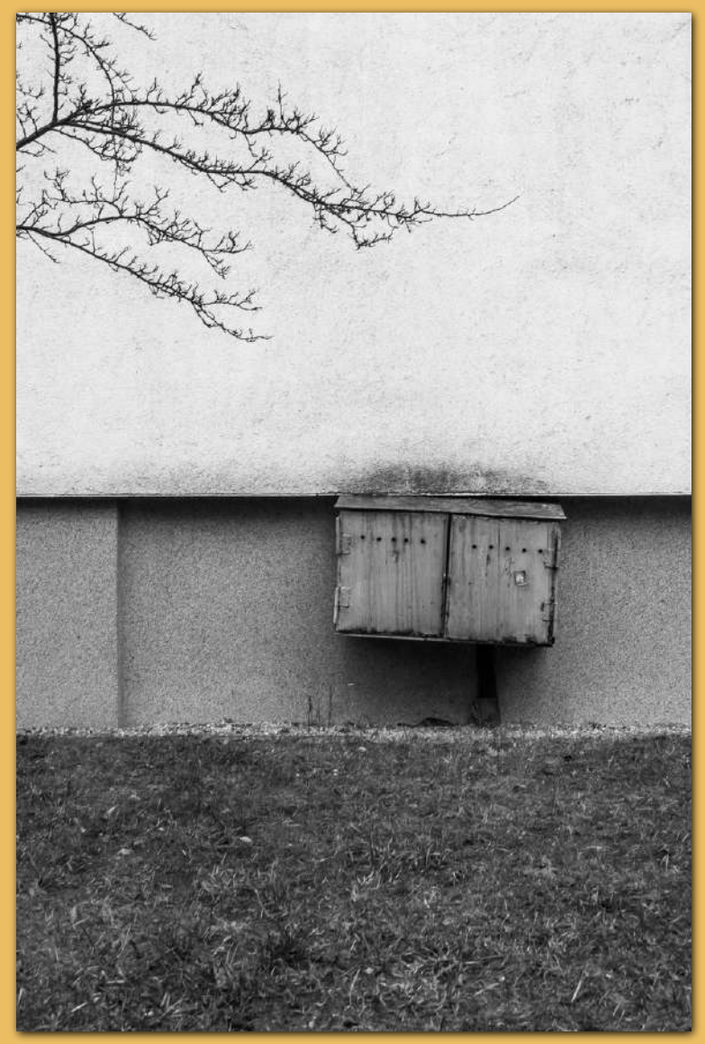
• Post "How to create better pictures? Part III"