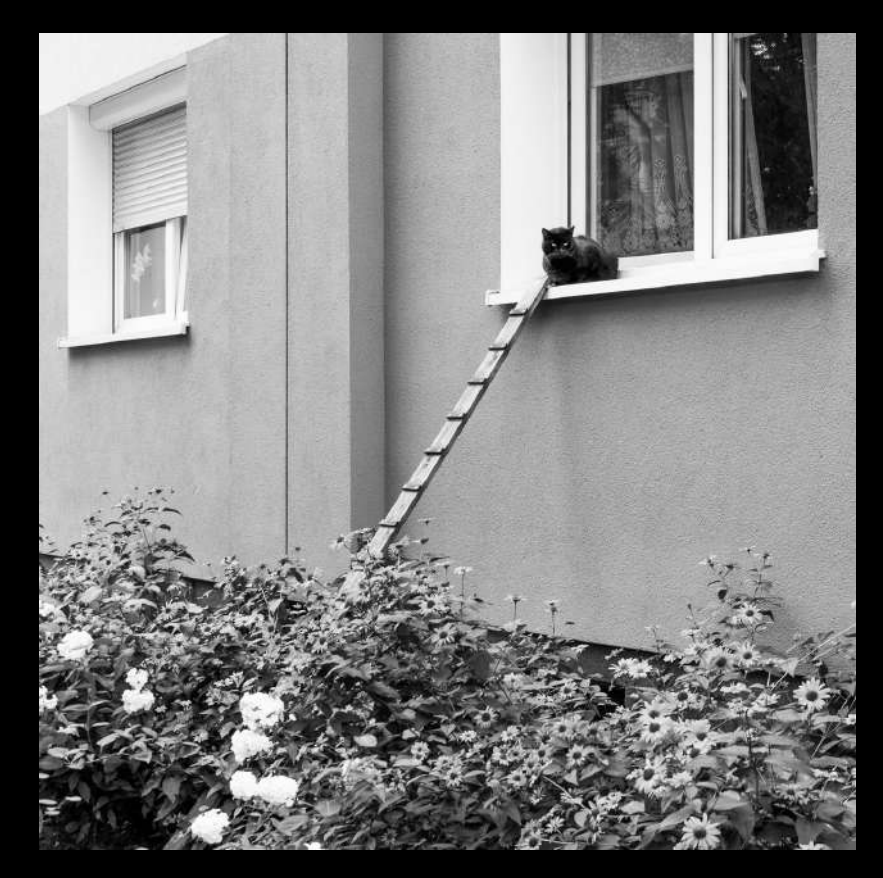
• Post "The twinkle in the eye" (also p. 9)

I wrote that the twinkle in my own eyes can bring inspiration in a subsequent post. Overall, I never paid too much attention to my appearance. My favorite outfit is a tshirt. I dress minimalist, and I always try to smell friendly in my surroundings. However, I never thought of myself as self-absorbed Narcissus. On April 22, 2018, I woke up at 6 am as usual. After making the toilet, I started washing my face. My reflection in the mirror caught my attention. I looked deep into my eyes and saw a twinkle in them. I've never paid too much attention to such things before. But on that day, I just saw it. The first thought that came to mind was something like, "Shit, I have nice eyes. It's nice to have a sparkle in your eyes. It is much better to have it than not." It was not a revealing thought, but after a while, I started to think about the fact that probably all people living on our planet have this magical gaze in their eyes. Some people have the eponymous gleam in their eyes, probably well hidden, even from themselves.