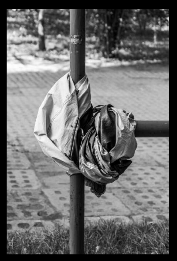
• Post "Natural energizer"

Later on, I wrote about natural energizers. The title did not refer to the energy drinks I used to drink when I weighed 99 kg in 2010. Now I don't want to pour this chemistry into myself anymore. Why? I don't want to be overweight. For me, one of the best natural energy sources that can raise the adrenaline level is music. Each of us has different moods every day. Sometimes we want to relax and calm down, resting after a hard day at work. For me, this is the best time to listen to, for example, classical music by Chopin or Henryk Wieniawski. Dire Straits' songs and the soundtrack from David Lynch's "Twin Peaks" can also set you in a blissful mood. On the other hand, we often need an immediate dose of energy. When I'm in this mood, I love to listen to the album "The Best of" Run DMC, for example. The real cherry on top, in this case, is the song "King of Rock." It gives you the power and willingness to do many things. When I have such natural energy, I can play sports or create art. Other good examples of how music can boost our energy include legendary albums such as Metallica's "The Black Album" and Iron Maiden's "The number of the beast."