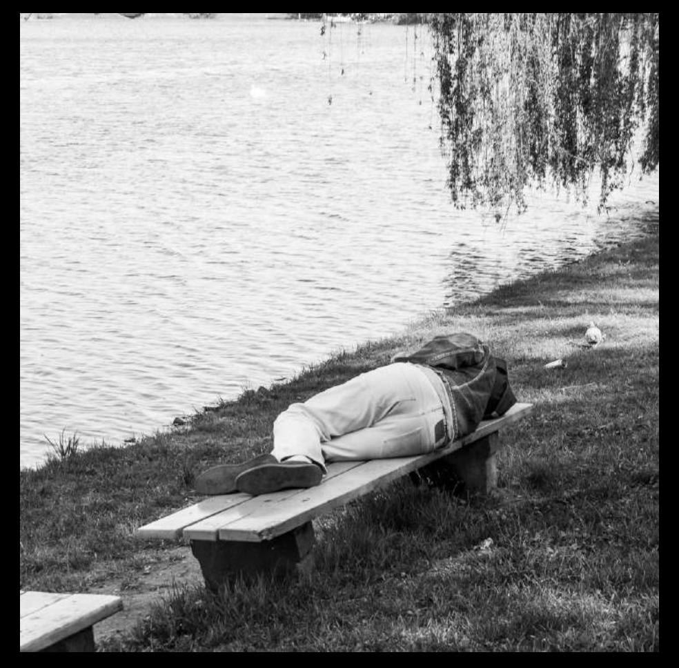
• Post "Shooting pictures of the strangers" (also p. 15)

All I know is that Facebook asked me one last time if I wanted to introduce face detection on my private profile. I agreed. From now on, the portal will inform me if someone adds my photo to their profile. I am happy with this option, and at the same time, I am afraid of all these changes related to privacy. However, I know one thing: I'm honestly glad that I didn't create too many street photos with visible human faces. If these kinds of images were the core of my passion, I would now have a hard time publishing these images. I'm glad I don't have too many problems with that right now. Overall, taking photos of other people is not my greatest passion. I think the people who do traditional street photography had more obstacles in doing their job. Upcoming regulations will not make their lives easier.