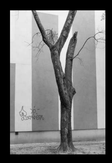
• Post "God as an Accountant"