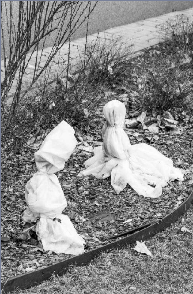
• Post „Art as a dialogue“ (also p. 16)

We can discuss with them, among others, by creating your own work. By doing this, we believe that someone will benefit from it someday. I am convinced that all artists hope to be an inspiration for the next future generations. I suspect that almost all artists dream of becoming famous people for their contemporaries and posterity. That is why I often think about art in the context of dialogue. All three parties (people from the past, present, and future) try to communicate with each other and convey their thoughts on many topics to others. Our predecessors undoubtedly wanted to inspire us and convey their knowledge, their view on the reality that surrounds them. Today we try to argue with them, to discuss, creating new things that we hope will benefit future generations. I have no doubts that art is a dialogue.