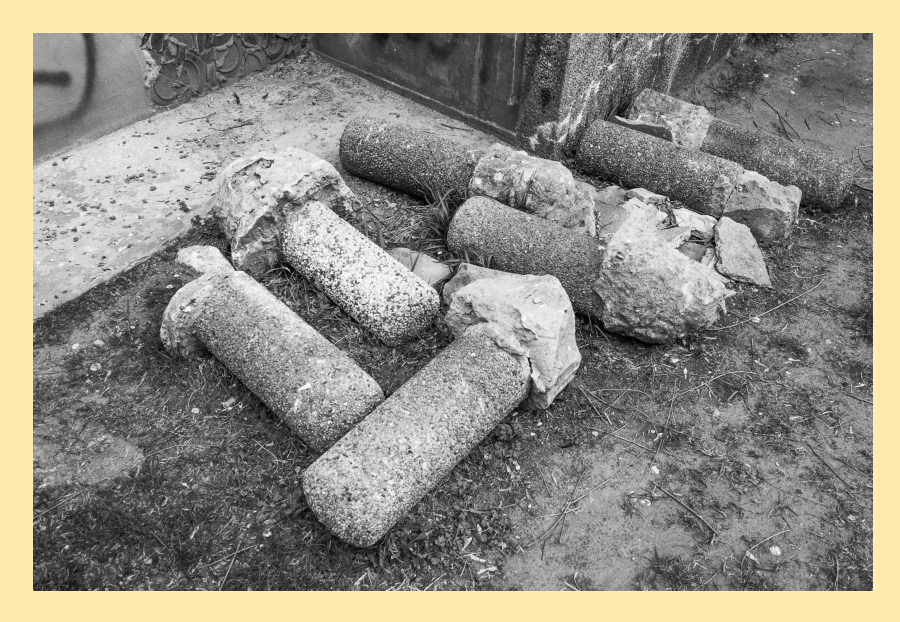
• Post "Motivation"

Nevertheless, looking at my own photos, I have noticed that they are the ones that give me one of the strongest motivations to continue working. I find it fascinating that walking the same streets for the nth time, I still see new objects to photograph. I often discover the same streets at a completely different time of year or day. Undoubtedly, my photographs provide me with a constant flow of artistic inspiration and motivation to work.